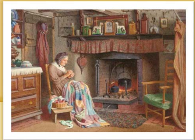
The Quiltmaker, Henry Tozer

A quilt is a warm bed covering made of three layers: top, batting, and backing. The top was often made of pieces of cloth left over from making clothing or cut from old, worn-out clothes. As settlers moved west, they cleared the land, built new homes, and established small towns. They brought many quilts with them because they knew the winters would be very cold. Quilts were also used to protect the family's valuables from breaking during the bumpy wagon ride west. They were used as cushions and beds for the tired travelers.