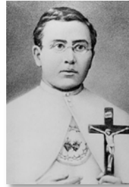
Saint Damien de Veuster of Molokai