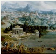
Seven Wonders of the Ancient World