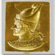
Unification of Upper and Lower Egypt