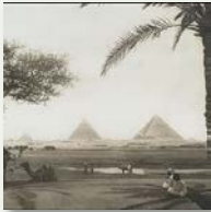
The Great Pyramid at Giza c. 2555 BC