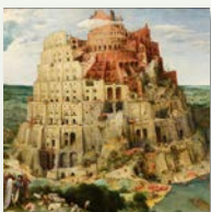
Tower of Babel